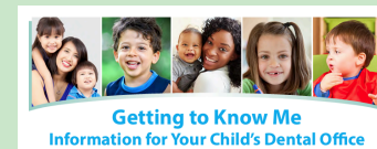
Getting to Know Me Information for Your Child's Dental Office

Before visiting a dentist, it is very helpful if a child's parent or guardian completes this form: