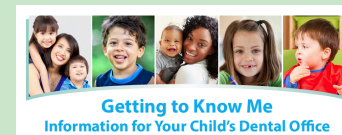
Getting to Know Me Information for Your Child's Dental Office

Before visiting a dentist, it is very helpful if a child's parent or guardian completes this form: