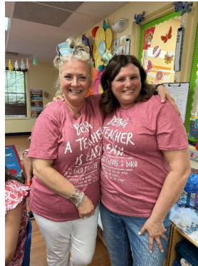
The Goddard School- Farm Lane