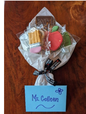
Solebury United Methodist Children's Learning Center