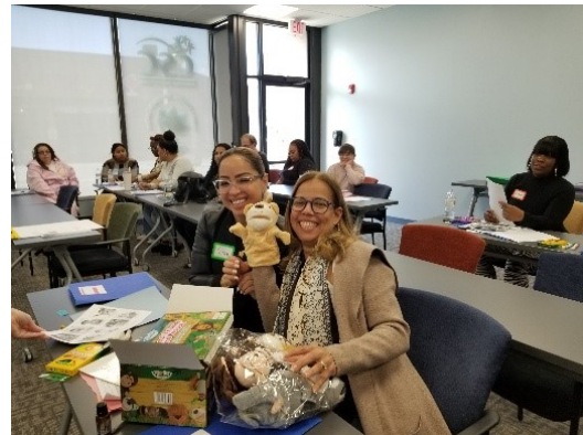
Attendees enjoyed opportunities to network and share experiences related to the three PD sessions.