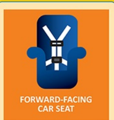
FORWARD-FACING CAR SEAT

Keep children rear-facing until they are at least two years old, or until they reach their car seat's height or weight limits. Convertible and 3-in-1 car seats usually have higher height and weight limits for rear-facing (compared to infant-only seats) so you can keep your child rear-facing longer.