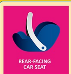
REAR-FACING CAR SEAT

Babies and toddlers need to ride rear-facing as long as possible.