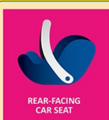
REAR-FACING CAR SEAT

Babies and toddlers need to ride rear-facing as long as possible.