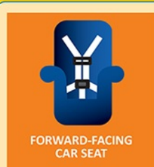
FORWARD-FACING CAR SEAT

Keep children rear-facing until they are at least two years old, or until they reach their car seat's height or weight limits. Convertible and 3-in-1 car seats usually have higher height and weight limits for rear-facing (compared to infant-only seats) so you can keep your child rear-facing longer.